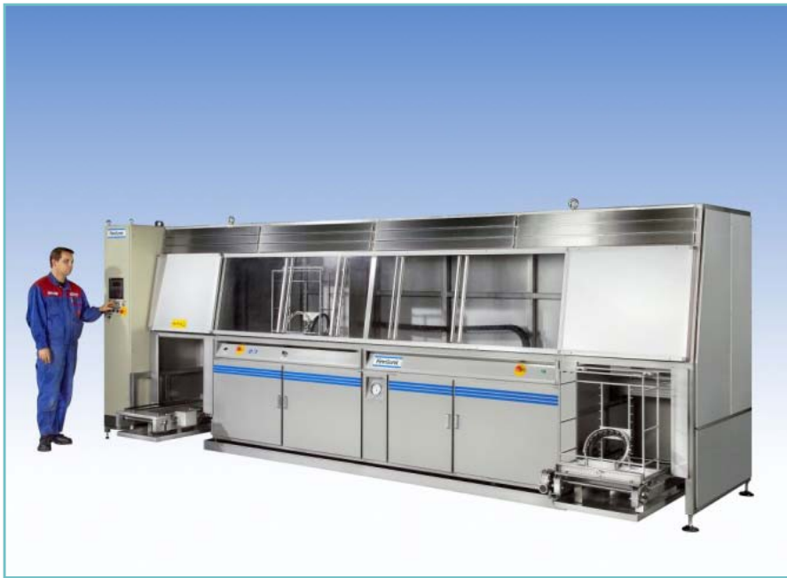
Automatic cleaning line for engine bearings Client: HAESL, Hong Kong