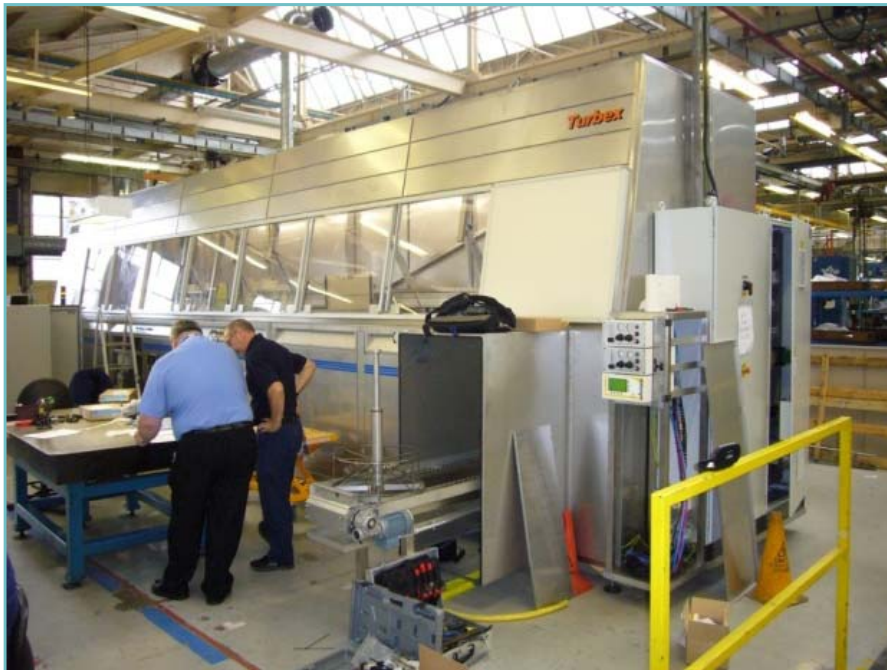
Automatic electrostatic FPI line Client: European aero engine manufacturer