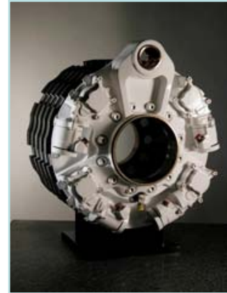
Cleaning system for aircraft brakes Client: Belgian Air Force, Belgium