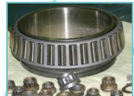
Automatic single chamber cleaning system for wheel and brake parts Client: Finnair, Finland